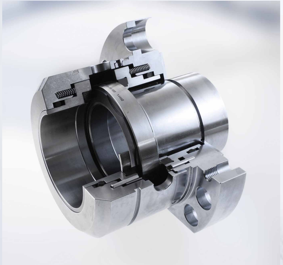
Successful seal design: EagleBurgmann SHPV-D (section model)

To meet the extremely high demands on the seal design reliably, FEA (finite element analysis) was applied to optimize the SH seals for fluctuating pressures, temperatures and speeds involved in operation and to ensure the optimum geometry for seal face and seat.