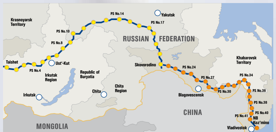
ESPO pipeline route from Taishet to Koz'mino